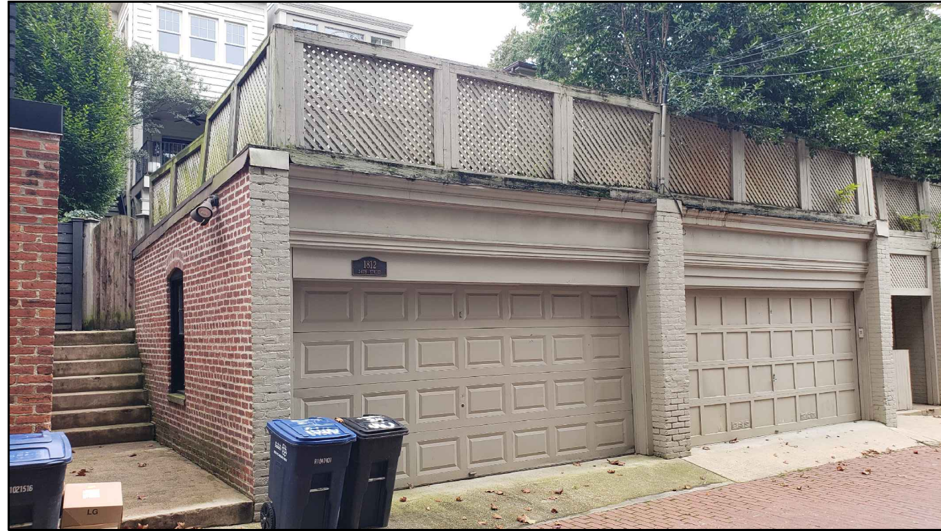
GARAGE FROM REAR ALLEY BEFORE FENCE DEMOLITION (OCT 2022)