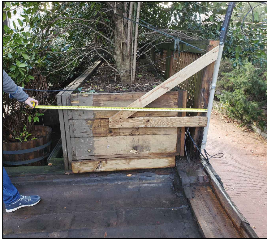
EXISTING TOP OF PARAPET WALL AND NEIGHBOR'S WOOD PLANTER ON GARAGE ROOF AT SOUTHWEST CORNER (NOV 2022)