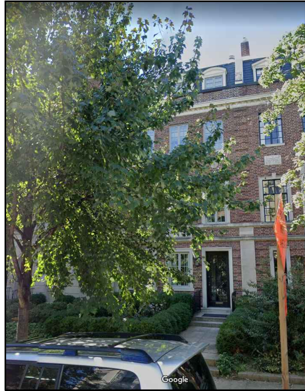
FRONT OF HOUSE FROM 24TH STREET (OCT 2022)