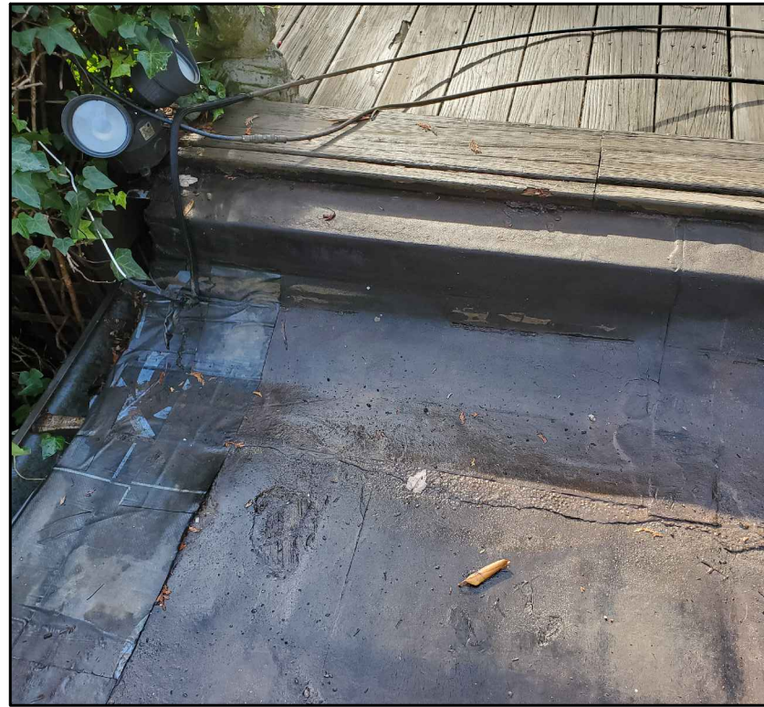
EXISTING TOP OF PARAPET WALL ON GARAGE ROOF AT SOUTHEAST CORNER (NOV 2022)