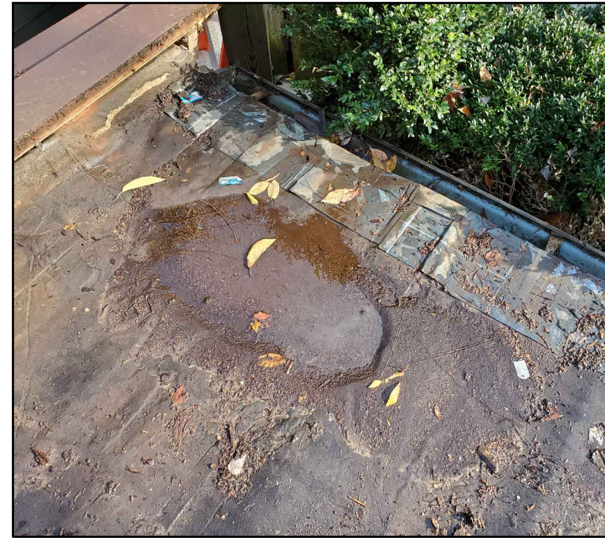
EXISTING TOP OF PARAPET WALL ON GARAGE ROOF AT NORTHEAST CORNER (NOV 2022)

Copyright © 2018 Jordan Honeyman Landscape Architecture, LLC. All rights reserved. [Culley, Levine, Residence] CAD Block Construction Drawing Permit Culley Levine 2023.03.27 Existing Conditions Page 4 of 10 (10.888 AM)